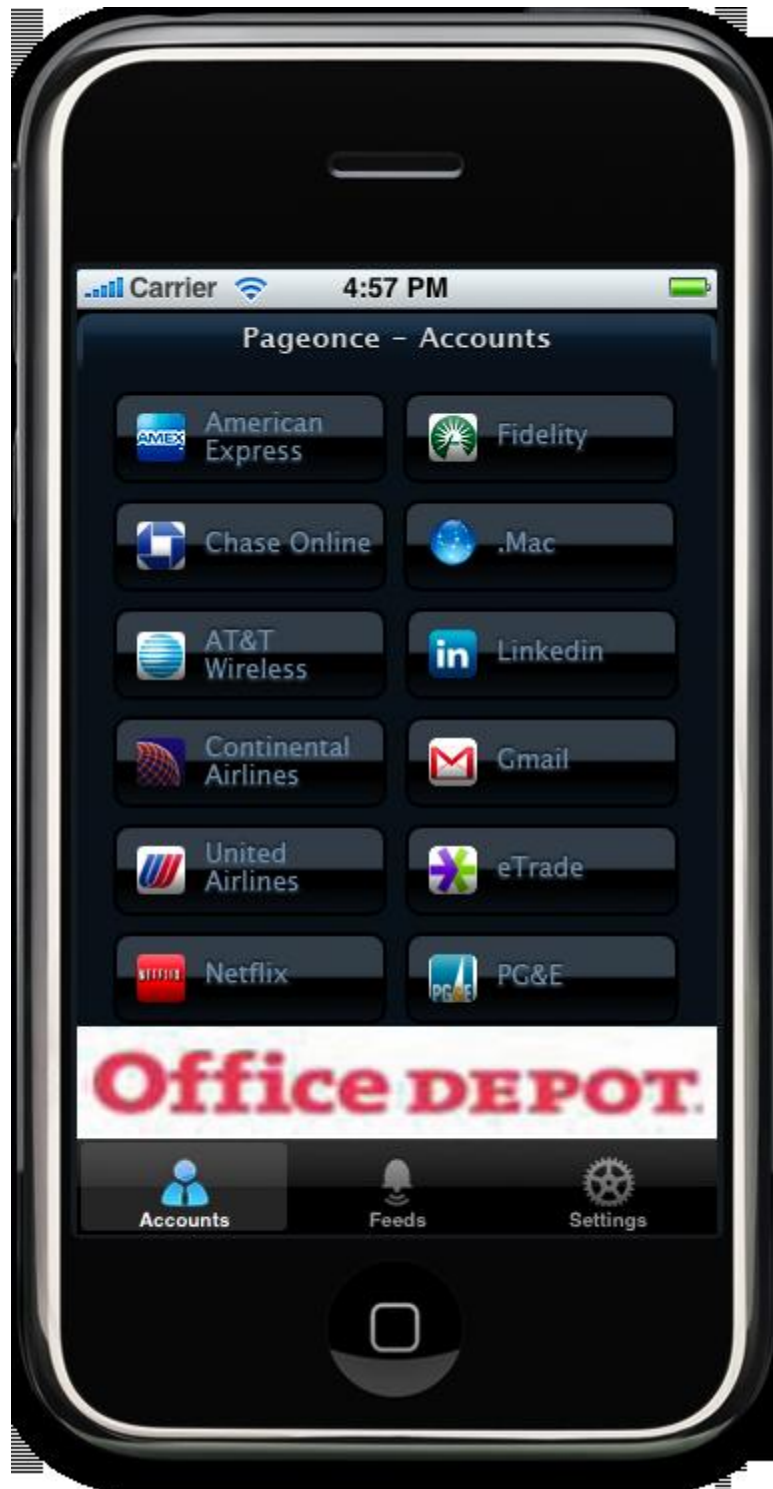
Pageonce – iPhone application – select account page with Smaato ad.